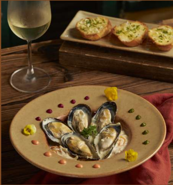
Steamed 'Ha Long' green mussels with cream sauce. roasted garlic bread 🍷🍞

Green mussels, carrot, shallot, garlic, butter, cream, celery