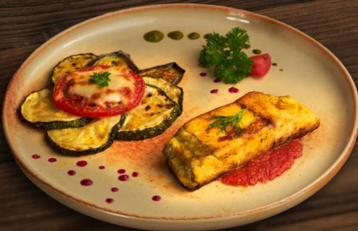
Grilled salmon with cream & mushroom sauce 🍷🍷

Salmon, cream, dill, caper, mashed potato, vegetables, onion